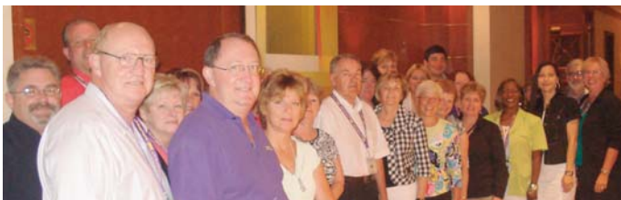
SEIU Local 1 Canada Hospital Workers Council Bargaining Committee

TORONTO, 17 Aug. 2009 – After one week of contract negotiations with the Ontario Hospital Association (OHA), SEIU Local 1 Canada held its ground on job security, made progress at the RPN Table, and emphasized important issues that are confronting our clerical and service members, both full and part-time.